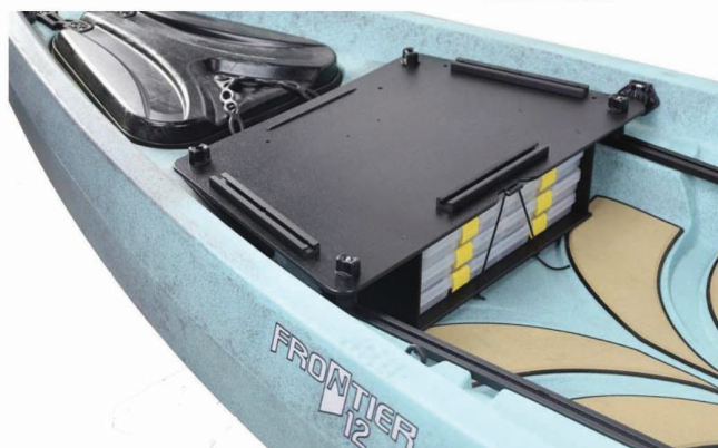
Installed and outfitted Frontier Console